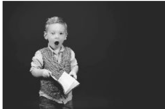
The boy gaped at his parents when he realized he had read the book all by himself for the first time.