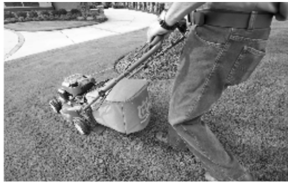
Larry spent hours each day in the summer manicuring his lawn.

Step 2: The below definitions are written in the order of the vocabulary above. Copy the correct definition for each word onto the lines in your packet. How close were your predictions?